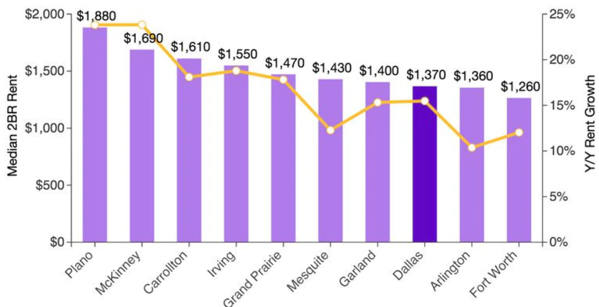
September 2021 Rental Trends: Dallas Metro

Net apartment leasing in the D-FW area totaled almost 15,500 units in the second quarter — about four times the apartment demand during the same quarter in 2020, according to RealPage.